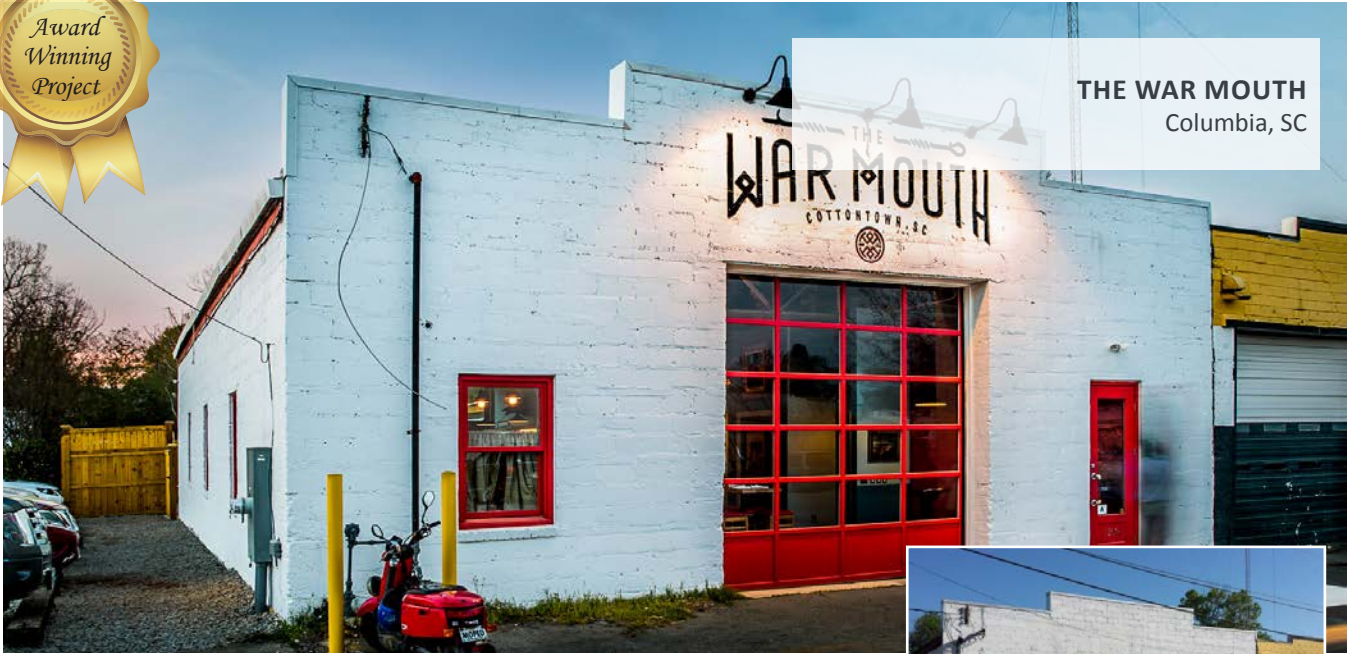
THE WAR MOUTH Columbia, SC